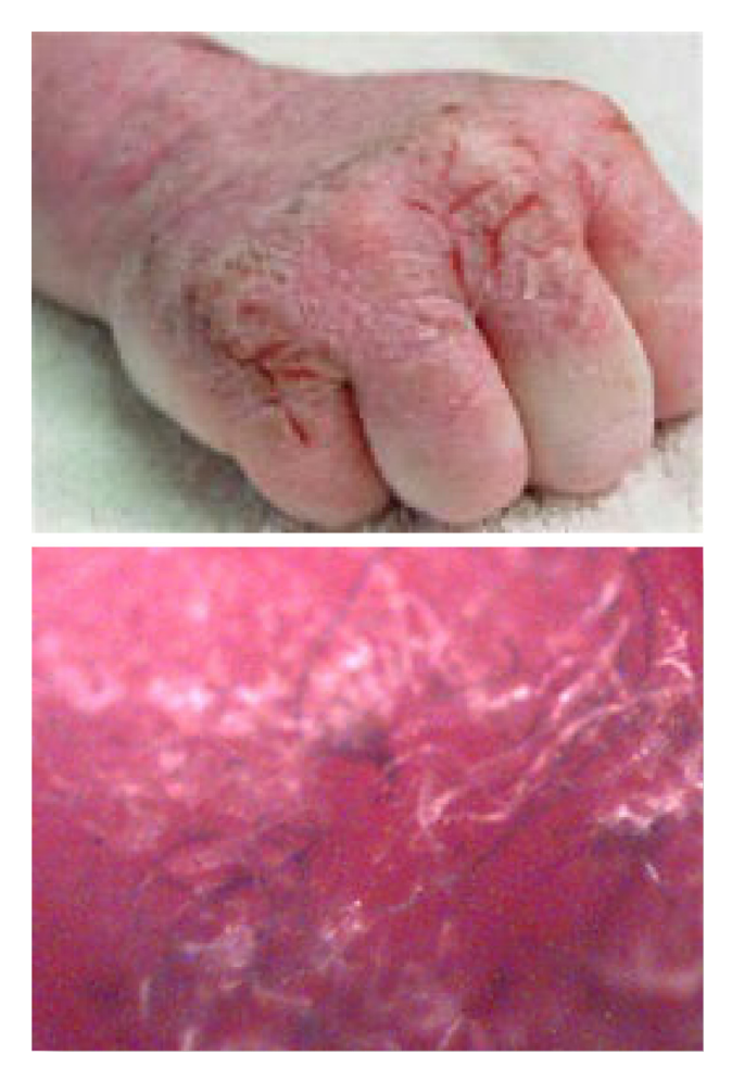
Figure 2 Morgellons disease. Note painful ulcerating lesions on hand (top) and subcutaneous white and blue fibers (bottom, 60× magnification).