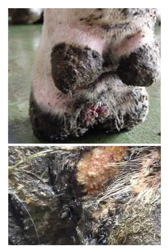
Figure I Bovine digital dermatitis. Note painful ulcerating lesion above the interdigital cleft of the hoof with multiple grayish fibers (top) and closer view of fibers (bottom).